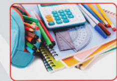
Educational materials (bags, pads, pens, etc.)