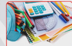
Educational materials (bags, pads, pens, etc.)