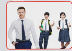
Clothing (students, office staff)