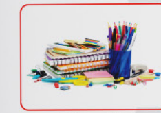
Training materials (bags, pads, pens, etc.)