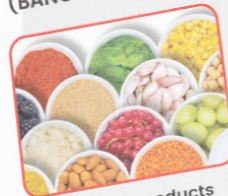
Safe food products