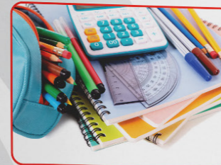
Educational materials (bags, pads, pens, etc.)