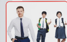
Clothing (students, office staff)