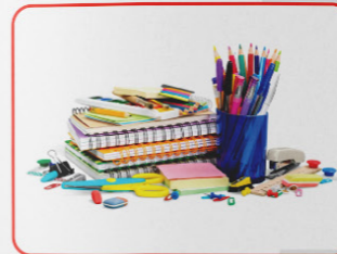
Training materials (bags, pads, pens, etc.)