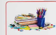
Training materials (bags, pads, pens, etc.)